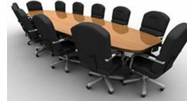
Board of Directors